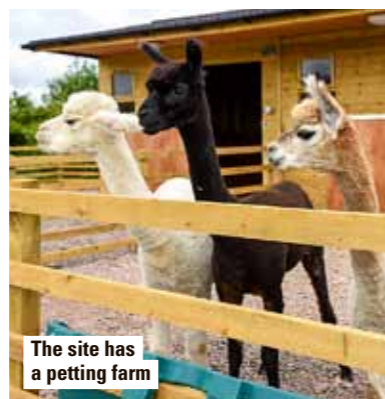
The site has a petting farm

NEED TO KNOW: Book at leisureresorts.co.uk/parks/ullswater-heights-holidays , from £486 a week for a single-storey tent that sleeps six or £558 per week for a two-storey tent that sleeps eight. Ullswater Heights also offers luxury holiday lodges for ownership and rental.