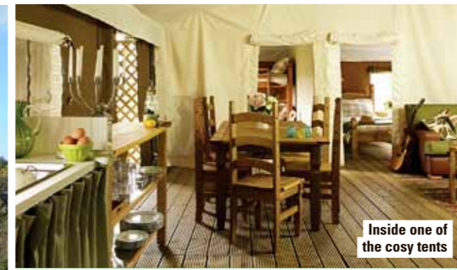
Inside one of the cosy tents

THE LOWDOWN: Putting the glam into glamping, these five luxurious safari-style tents are dotted around a field deep in the Lancashire countryside. Inside, there are three bedrooms – the main with a king-sized bed, one with bunk beds and the other with two singles. The open-plan kitchen, dining and living area has a wood-burning stove to keep you toasty on cooler nights. And