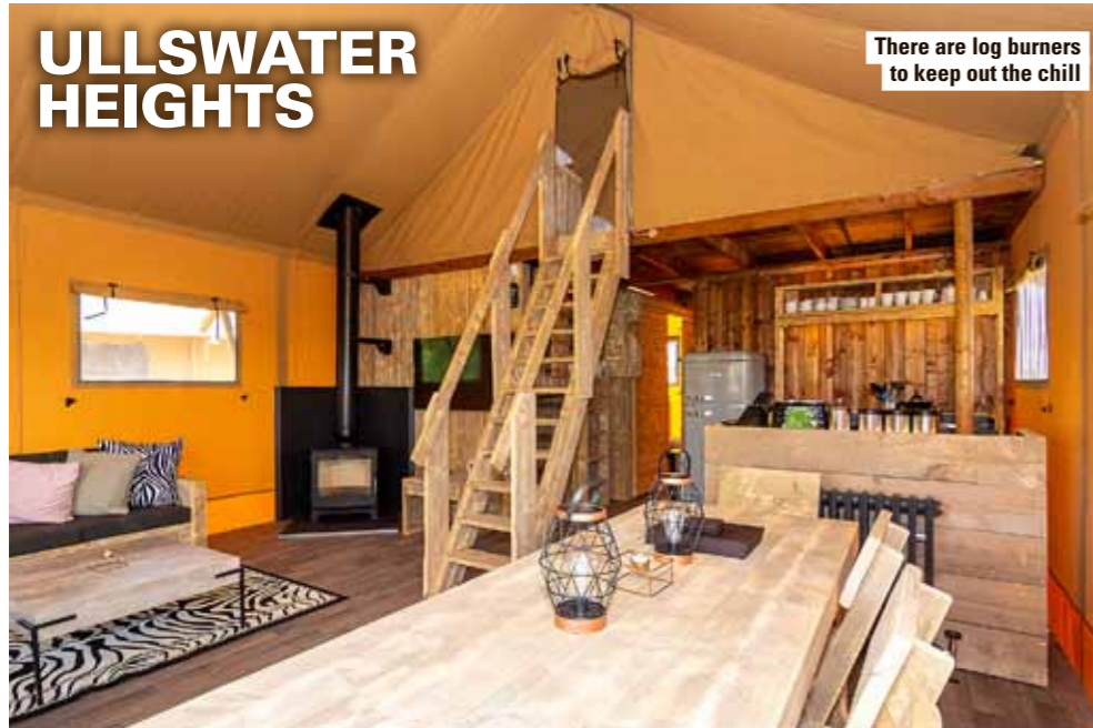
There are log burners to keep out the chill