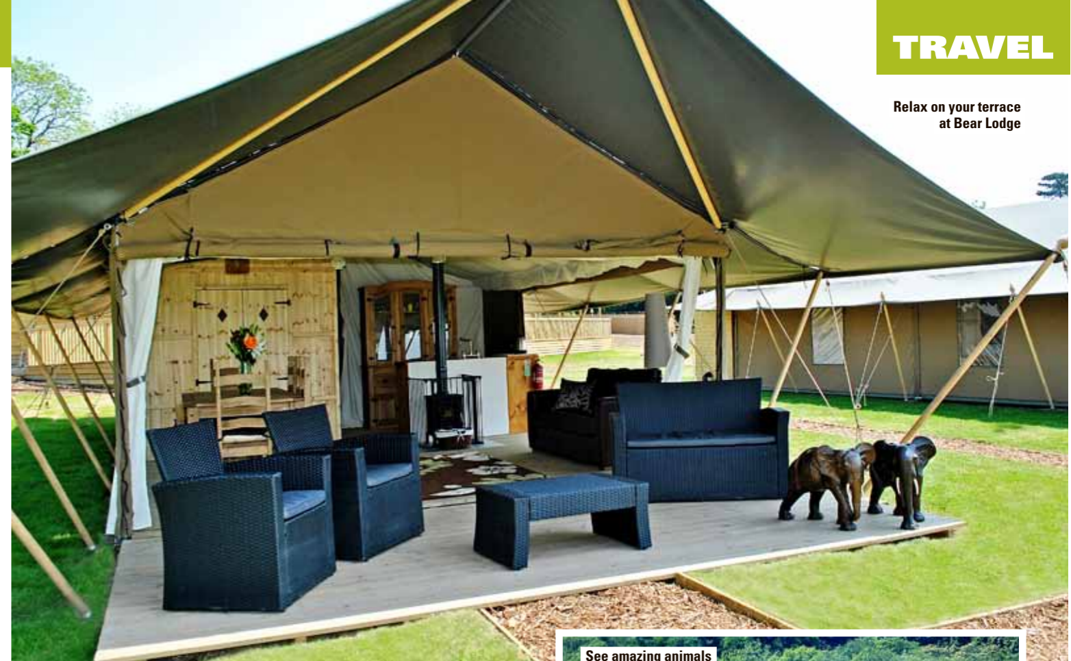
See amazing animals up close on a safari tour

Down the road from the site, you'll find an honesty shop, where there are games and fishing rods to borrow and charcoal, snacks and drinks for sale. Dogs are welcome at the site, too, so your pooch needn't miss out on the fun.