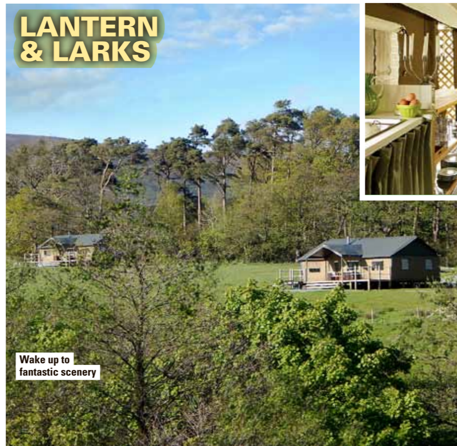
Wake up to fantastic scenery