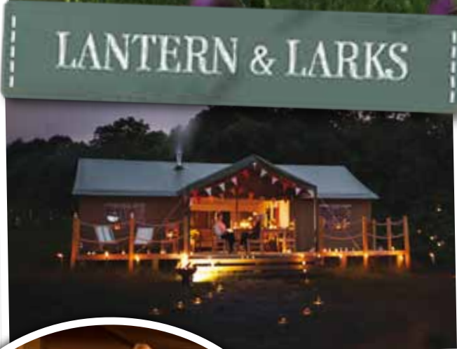
A view of our tent at Exton Park and, inset, the bedroom.