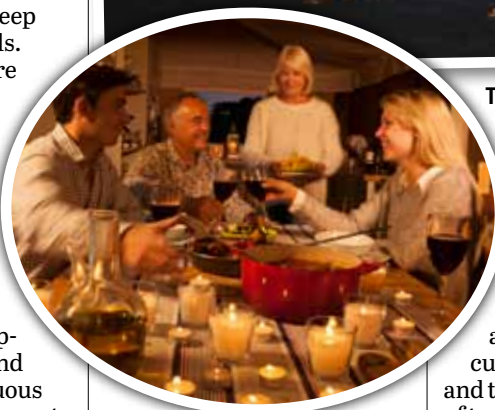
The lodge lit up at night, above, and, left, wining and dining.

the terrace was pure bliss, with the only the sounds coming from the quacking and splashing of the local wildlife.