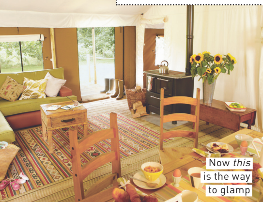
Now this is the way to glamp