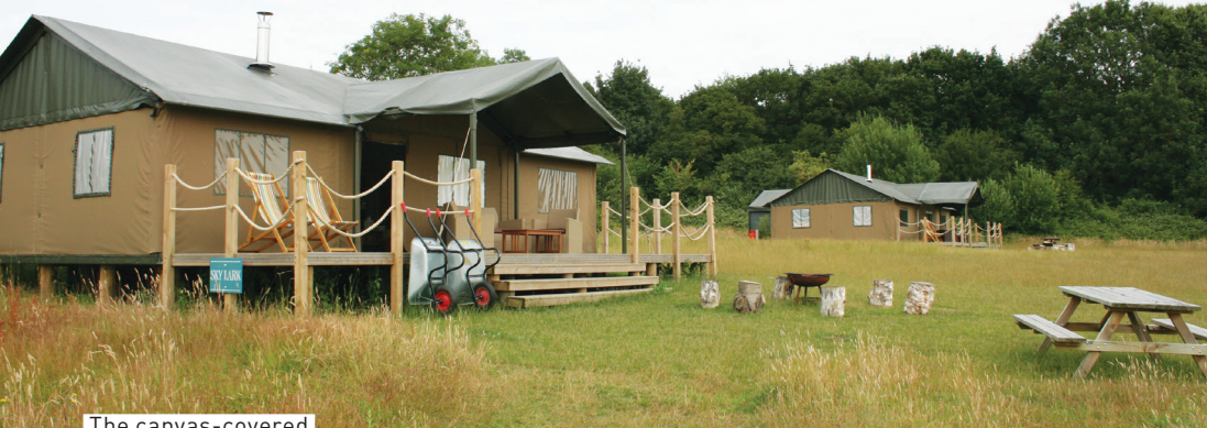
The canvas-covered huts take camping to a whole new level